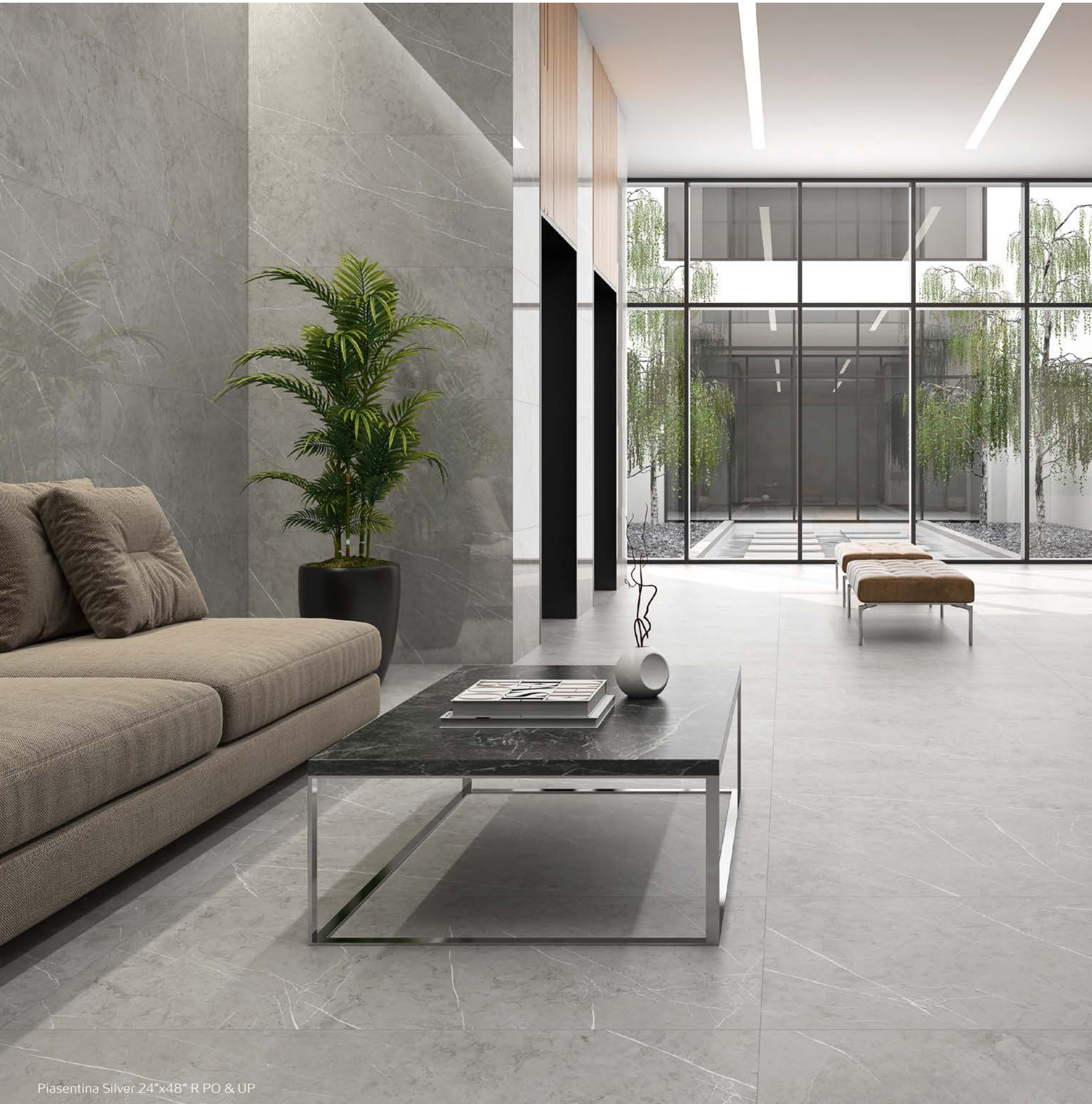
Piasentina Silver 24"x48" R PO & UP

The traditional and elegant Piasentina stone is the inspiration of this porcelain tile, highly resistant and versatile. For both commercial and residential projects that strive to evoke sophistication and delicacy.