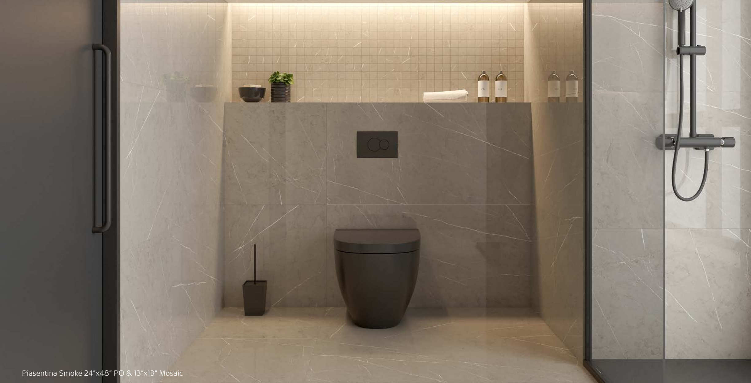
Piasentina Smoke 24"x48" PO & 13"x13" Mosaic